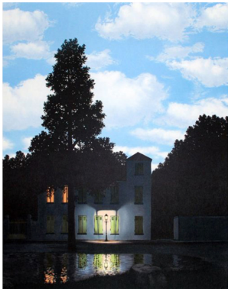
Upon the hours of reflection for home: L'Empire des lumières by René Magritte.